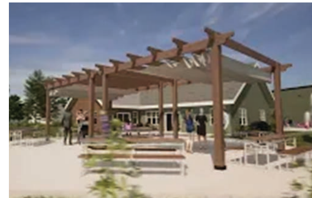
Melmark New England is developing plans for a new Adult Planned Community of Care center.