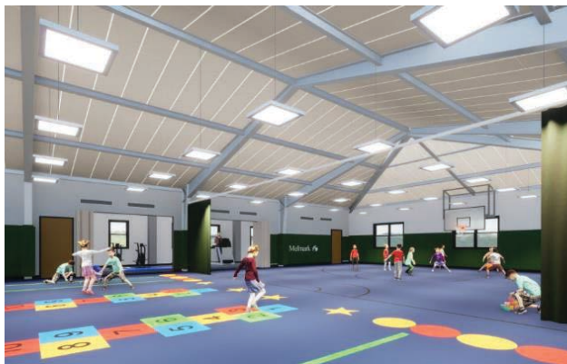
Melmark Pennsylvania is planning Phase Four of the Health and Wellness Project including a new physical activity center and upgrades to the healthcare suite.