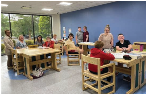
Melmark Carolinas started classes in their new school building in Charlotte, NC in the summer of 2023.